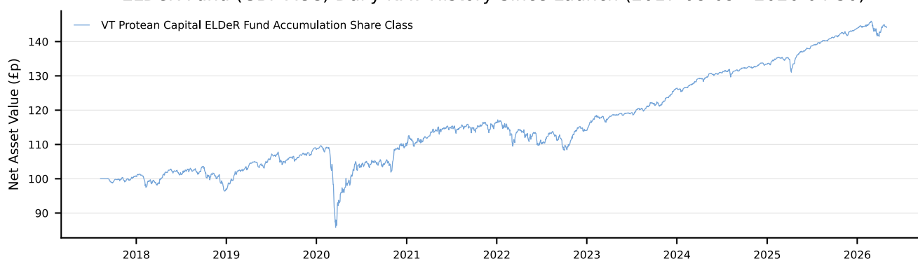
ELDeR Fund (GBP-ACC) Daily NAV History Since Launch (2017-08-09 - 2026-04-30)